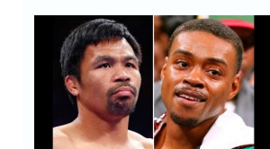
Manny pacquiao errol spence jr fight. Errol spence jr vs manny pacquiao tickets. Manny pacquiao vs errol spence jr date. Manny pacquiao errol spence jr purse. Manny pacquiao vs errol spence jr videos. Manny pacquiao errol spence jr odds. Manny pacquiao errol spence jr tickets. Manny pacquiao vs errol spence jr fight.